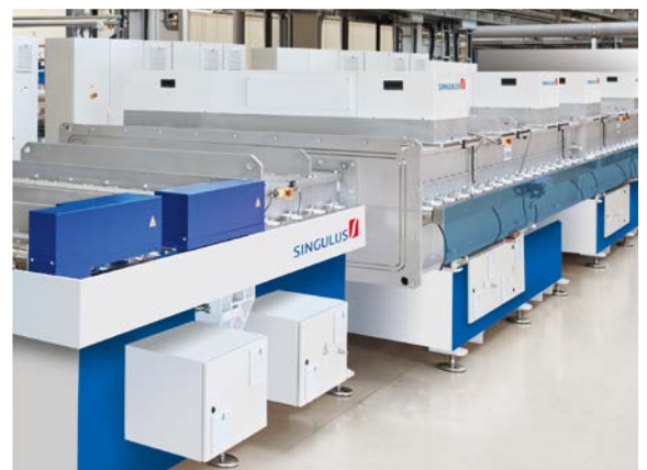
Inline Sputtering System with Horizontal Substrate Transport for Flat Substrates

SINGULUS TECHNOLOGIES pursues the integrative validation strategy and supports customers in the validation of machine technology. The corresponding quality management system has been adopted at SINGULUS TECHNOLOGIES. This serves to guarantee product quality and meet the binding marketing requirements of health agencies, in particular the rules of GxP/FDA.